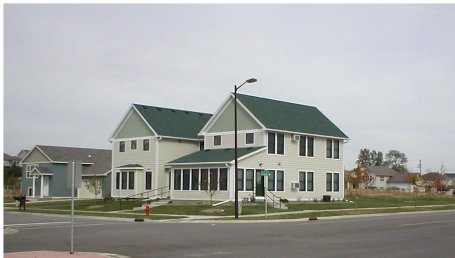
Marilyn's Place Fourplex